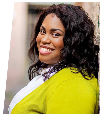
Angie Thomas (right) is the author of this year’s Malden Reads pick, “The Hate U Give.”

The book has been a huge hit with people of all ages in Malden, enjoying perhaps the widest readership of all eight successful years of the “One City, One Book” program. The extensive series of events and programs have included book discussions, community dinners, film screenings, a special “Conversation on Race,” youth events, and family/cultural programs. If you do not already follow the program, be sure to sign up for the email list at maldenreads.org . And it’s not too late to read the book and join the conversation!