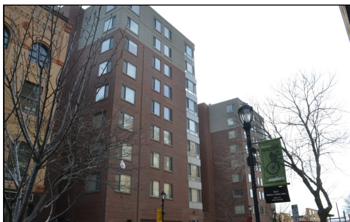
Is Smart Growth the future of Malden? Check out the new series on the topic of development in the city.