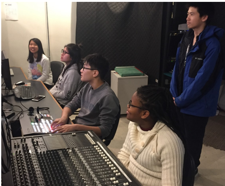
MHS Movie Production Club crewing for Malden Families First.

initial training including studio production, on location production and post production. I was amazed by how fast the students learned and