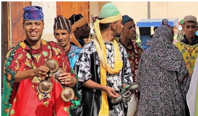
Street musicians in Marrakesh from "A Road to Morocco ... from Malden" in Neighborhood View.