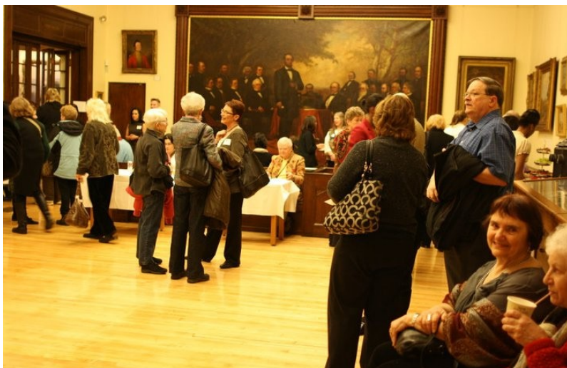
"Lincoln at Gettysburg" (the large painting seen in the backdrop) is the subject of the first in a series of "Art Treasures at the Library."