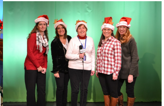
Members of Malden School Department's Title One Program record their greeting.