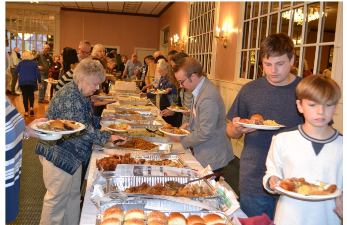
MATV is always thankful to all the local restaurants who donate some incredible food for our buffet dinner.